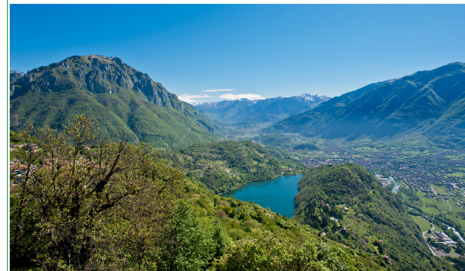
Tavola 8. Densità della popolazione residente