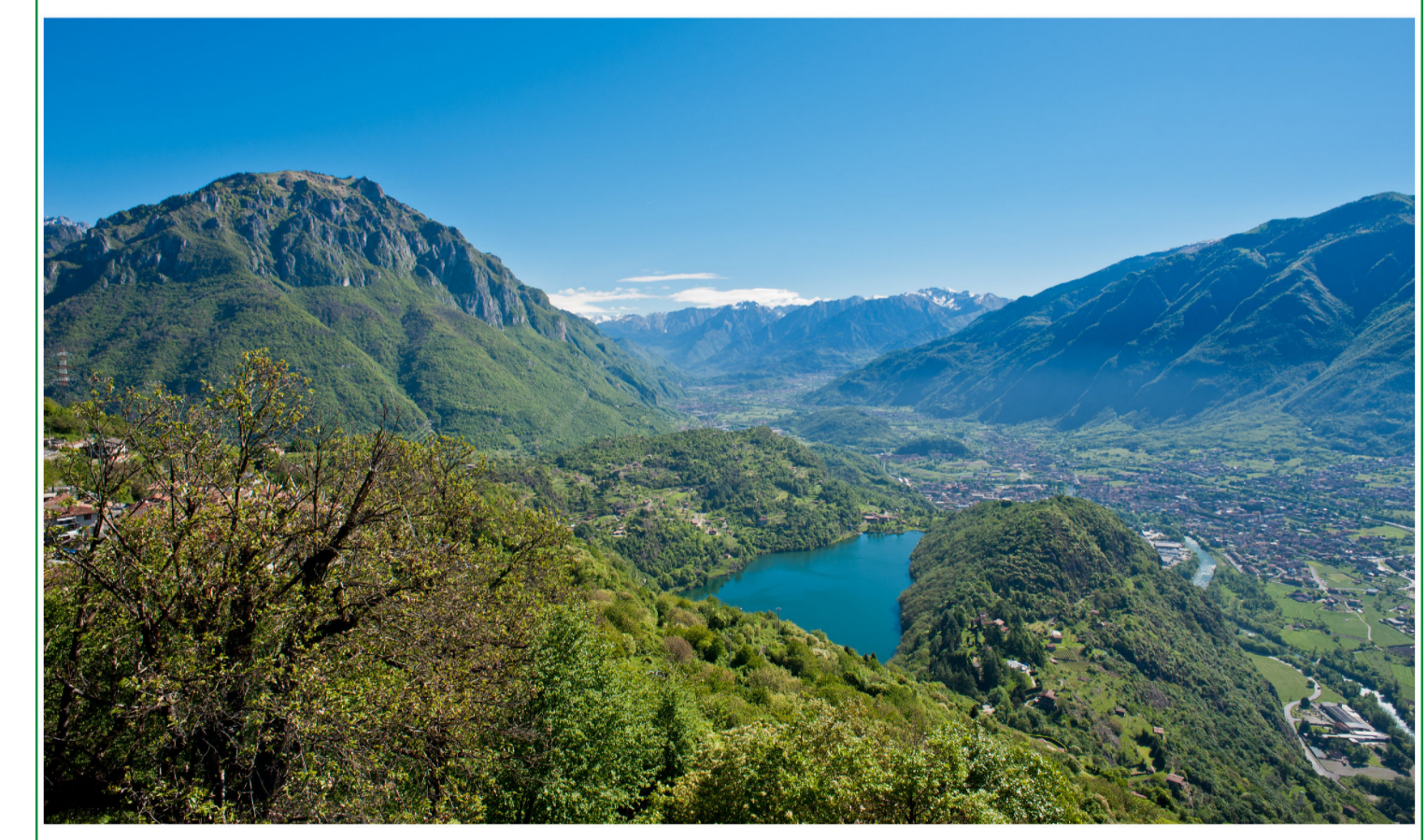
Tavola 6. Profilo altimetrico della riserva e zonazione